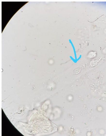
Figure 2: Urine microscopy, repeated on two separate occasions, revealed the presence of Schistosoma ova.