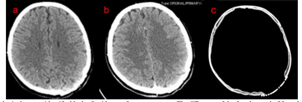
Figure 3: Follow-up radiological survey identified lack of evidence of recurrence. a–c. The CT scans of the fourth month, fifteenth month, and second year after surgery, respectively.