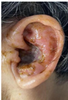
Figure 1: Left ear of the patient: white pus with paste of Chinese medicine (yellow part).

Physical examination revealed a drunken gait and facial paralysis of the left side was found. The facial voluntary movement was evaluated with the House-Brackmann grading system, and the peripheral facial paralysis was belonged to be House-Brackmann grade III. There are many purulent secretions in the left ear (Figure 1), however, no rash was observed on the right ear, trunk, and limbs. The patient had hearing loss and was unable to cooperate with pure tone audiometry. We also found that the left forehead wrinkles disappeared, the left nasolabial groove became shallow in this patient (Figure 2).