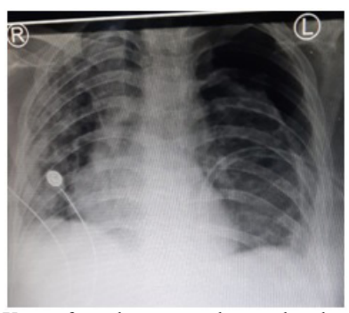
Figure 4: Chest X-ray, after tube pneumothorax thorakostomy was performed