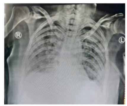
Figure 3. Chest X-ray findings confirmed