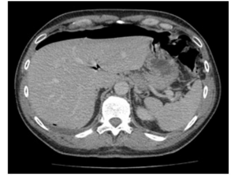
Figure 1: CT scan that shows free air under the right diaphragm without other signs of JID perforation.

According to the new clinical conditions, we decided to make an abdominal CT scan that showed free air under the right diaphragm but didn't show free liquid in the abdomen (Figure 1); the mechanical rectal suture was complete, and the CT scan didn't show free air in the mesorectal and pelvic area (Figure 2).