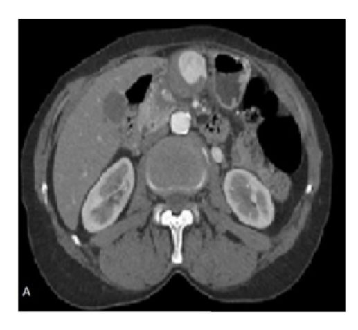
Figure 1: Axial abdominal computed tomography scan with contrast injection showing

The patient has remained in the intensive care department under follow-up for her artery celiac dissection. During the six months of follow-up, no operative complications have occurred, and she was clinically well. No specific lesion has been identified in the histopathologic examination of the resected specimen, as well as, the bacteriological exam was negative.