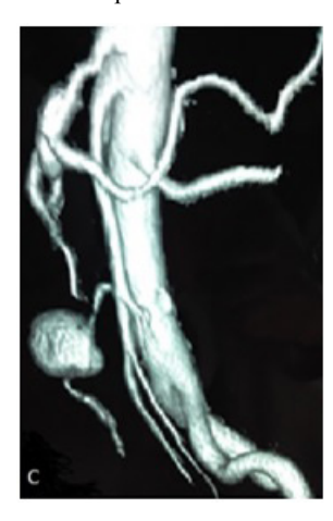
Figure 1C: Volume rendering reconstruction showing a true aneurysm of a middle colic artery