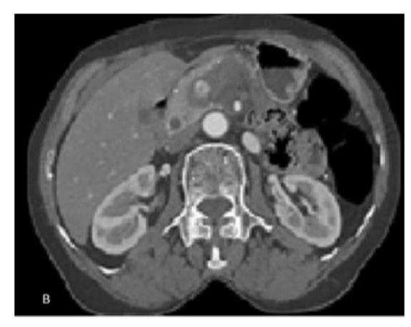
Figure 1B: There was a hematoma surrounding this mass and spreading out into the peri-pancreatic space