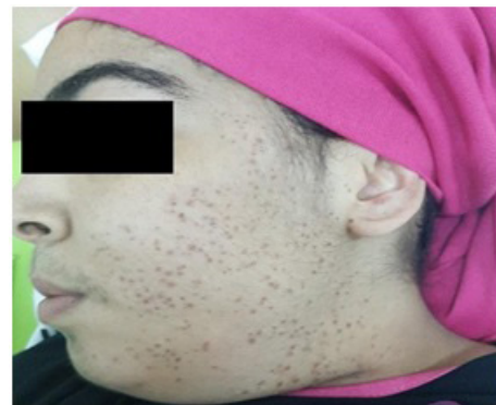
Figure 1: Centripetal fat deposition face, facial plethora, rounded face, buffalo-hump, face acne, Melanodermia

pnia. Clinical examination revealed an altered general state, obesity with centripetal fat deposition face, supraclavicular and dorsal and cervical fat pads, facial plethora, rounded face, buffalo-hump, face acne, melanodermia, capillary fragility, face, arms and legs hirsutism (Figure 1-4).