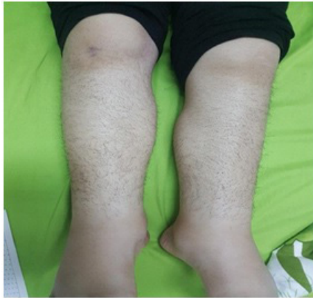
Figure 4: Legs Hirsutism

She had not palpable adenopathy. The abdomen was bloated. She had hepatomegaly with hepatic arrow of 20 centimeter, 2 lower limbs pitting edema. Her blood pressure was 11/9 with oliguria.