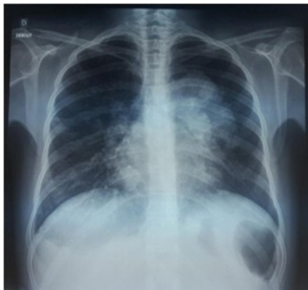
Figure 5: Chest radiograph: left para-mediastinal mass

Chest radiograph (Figure 5), Cerebral, Thoracic, abdominal and pelvic CT (Figure 6-8) imaging revealed a voluminous left para-mediastinal tumor process, multiple mediastinal lymphadenopathies, many bilateral pulmonary nodules, and hepatomegaly with metastasis.