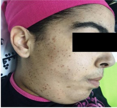
Figure 3: Centripetal fat deposition face, facial plethora, rounded face, buffalo-hump, face acne, melanoderma