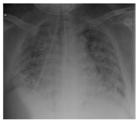
Figure 1: Chest-Xray

Due to clinical and biohumoral worsening (stable CRP at 24 mg/ dl), tocilizumab (800mg) was performed on 03/24/2020 (no contraindication), after acquiring patient's informed consensus. The Resuscitation evaluation agreed for continuation of ventilatory support with the CPAP helmet.