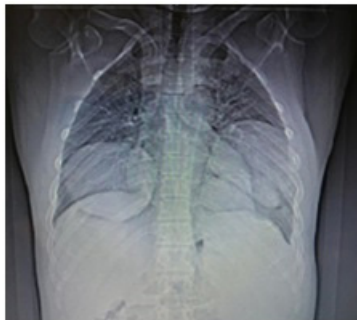
Figure 1: Show CXR with billateral cystic mass of two lung.

an oval shape with regular contours and with enhancing after injection of the intra venous contrast media. The size of spleen cyst was 10 \times 6 \times 7 mm and presents a close contact with the left hemidiaphragm (Figure 3,4). The diagnosis was mad by CT-sca and CXR, bilateral hydatid cyst of pulmonary associated with hydatid cyst of spleen location. Because of good condition of patient( power and young) , Our Surgical management was one stage for this case As: patient putt in Simi supine position on the left side and start with and particularly with the left side which is the site of the largest cyst of right side , right lateral thoracotomy in the sixth intercostal space with cystectomy, peri-cystectomy and captinnage for obliteration of remnant cavity (Figure 5,6,7) then the pherintomy was performed and evacuation of spleen cyst and omentoplasty for obliterating of remnant cavity, splnectom not performed because 80% of spleen was intact, diaphragm was close with nylon sutures .Chest Tube placed in left pleural space and ches wall closed The patient putt in supine position next surgical procedure was right antero-lateral thoracotomy in the sixth intercostal space with cystectomy, peri-cystectomy and captinnage for obliteration of remnant cavity as by the same procedure on the left side .. The patient was discharged six-day post operation with good condition on oral albendazole 800 mg per day for three course with 14 day interval (Figure 8) post- operative CXR.