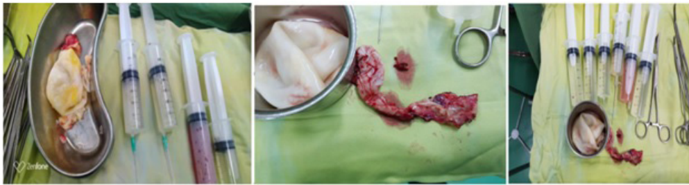
Figure 5,6,7: Show laminatted membran .pricyst and fluid of cysts after aspiration.