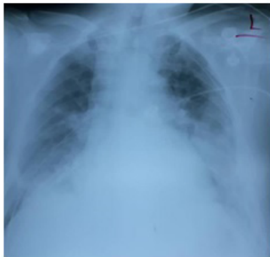
Figure 8: Show postoperative CXR.