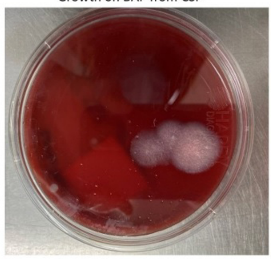
Figure 4: Growth on BAP from CSF, Coccidioides immitis identified on DNA probe.