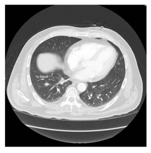
Figure 1: CT thorax showing a 4 mmand 3 mm pulmonary nodule at right lower lobe.