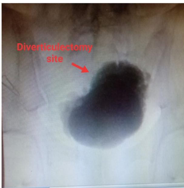
Figure 3: Postoperative Cystogram showed no evidence of contrast leakage from area of diverticulectomy.