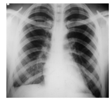
Figure 1: Chest x-ray at admission to ER

During the same night, his chest pain increased, as well as in the next 2 days, which together with the shortness of breath, lead the patient to come to our ambulatory, where we re-evaluated his chest x-ray (Figure 1), and we took an arterial Blood gas Analysis, which demonstrated PaO2 71mmHg, PaCO2 30 mmHg pH 7.46.