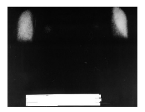
Figure 2: Lung scan scintigraphy three days after the accident