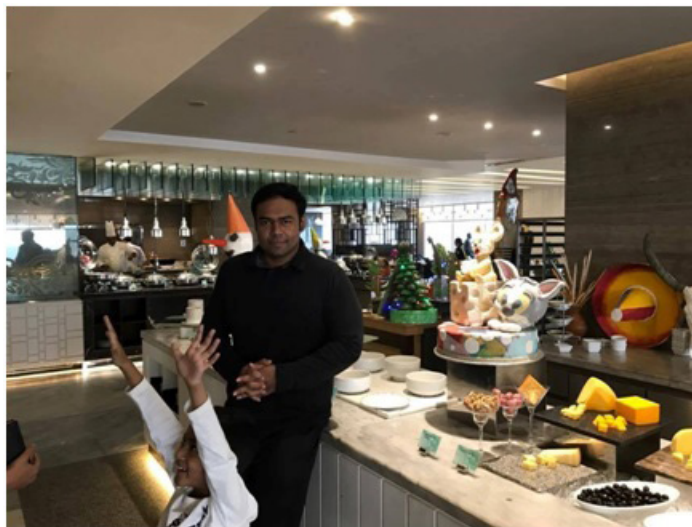
Figure 2: The Author