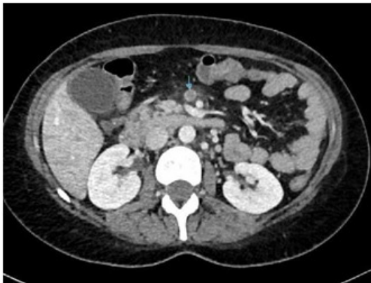
Figure 1: showing Mesenteric Vein thrombosis ( marked with arrow)

An abdominal ultrasound was done on day one of admission which was reported normal with no evidence of acute cholecystitis, portal vein abnormality or liver abscess. A CT abdomen done on the same day showed a filling defect in the tributary of the superior mesenteric vein (Figure 1) suggestive of superior mesenteric vein thrombosis (SMVT), and bowel wall thickening in the distal ileum involving the ileocecal junction suggestive of inflammatory bowel disease.