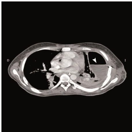
Figure 1: Contrast thoracic CT scan showing a left pleural effusion (white arrow).