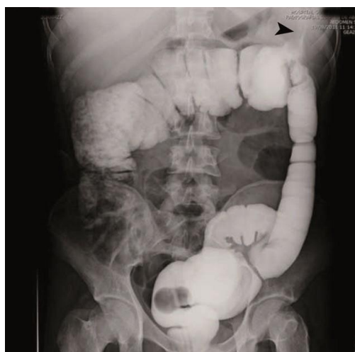
Figure 2: Contrast barium enema showing communication between colon and pleural cavity (black arrow).