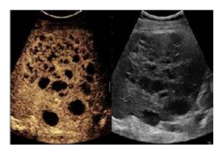
Figure 2: Intravenous CEUS in multiseptated liver abscess. CEUS & B-mode side-by-side imaging. IV CEUS is advantageous over B-mode imaging, delineating the cystic parts, as well as the margins of the complex abscess.

With regards the single misplaced catheter attempt, after slight retraction, a complementary Sonovue<sup>®</sup> injection demonstrated the accuracy of the positioning ( Figure 4 ). No communication between the abscess and surrounding vessels or bile ducts was detected.