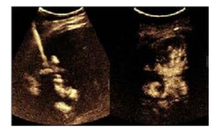
Figure 3 : Endocavitary CEUS. Intracatheter Sonovue" injection demonstrating proper drainage catheter placement and intracavitary communication between multiple abscess cavities.