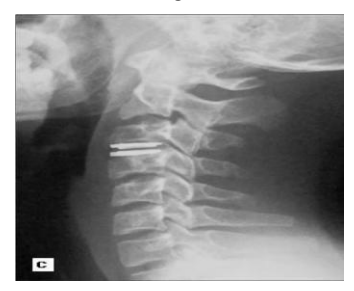
Figure 3: Postoperative radiographs demonstrated good realignment of the cervical spine.