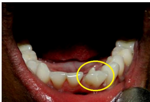
Figure 2: Talon's cusp on the lingual side of the 2 fused teeth (encircled)