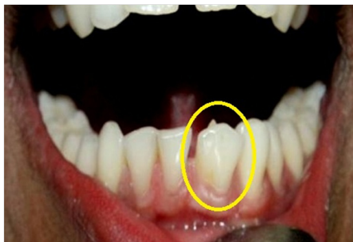
Figure 1: Fusion of mandibular left central and lateral incisors (encircled).

An intra-oral periapical radiograph for both the teeth was taken which revealed a radio-opaque area between the crown portion of both the teeth. Further, radiograph revealed no interdental space in between the teeth suggestive of fusion ( Figure 3 ).